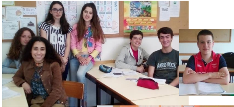
↑ D teens →